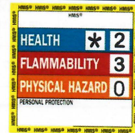
HMIS III LABEL

Personal Protection Index NPCA recommends that PPE codes be determined by the employer, who is familiar with the actual conditions under which chemicals in the facility are used.